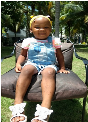
Rachaira Exantus Preschool