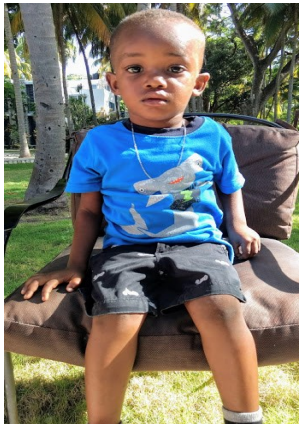
Jean Laurent Derly Preschool