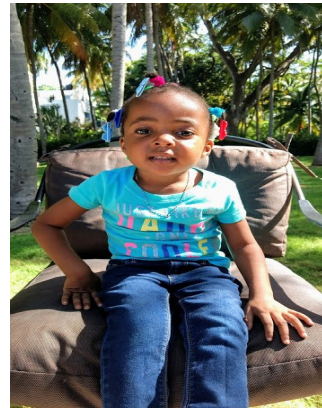
Emilie Joseph Preschool