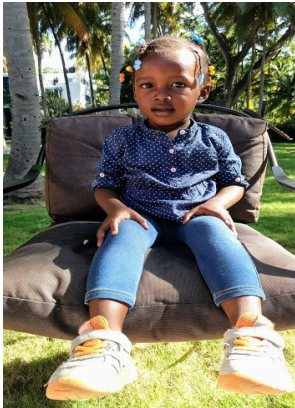
Shamelaï Garçon Preschool

The sponsorship cost of $40 per month is used to pay the tuition, books, and uniforms for one child to go to school. The child is also given lunch each school day and medical care if needed. Sponsors will receive at least one picture a year.