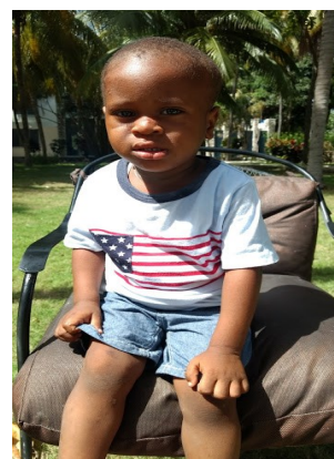
Ajun Belzince Preschool