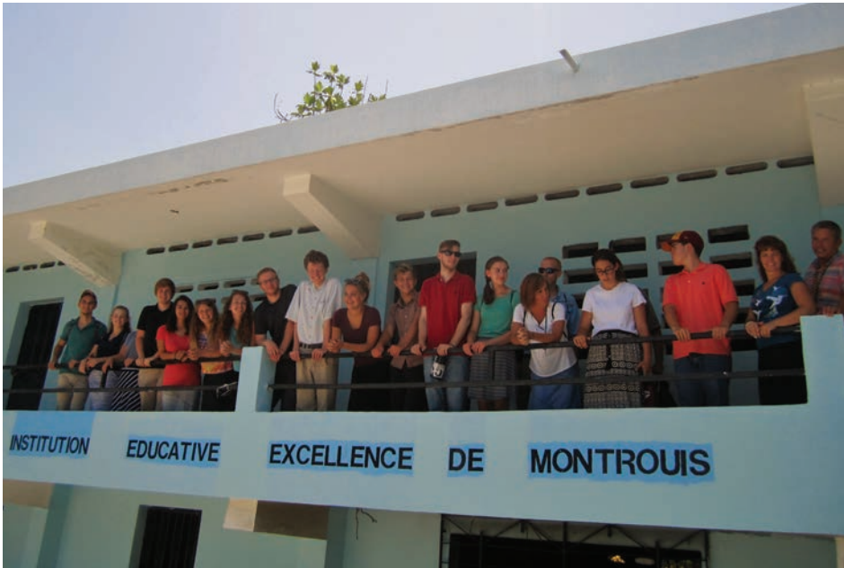
A youth team from Greenridge Baptist Church in Maryland visits the mission in July.

The Greenridge Baptist youth visited the mission in late July this year. As a leader and part of LCM, I have to say they really blessed me with their servant hearts. They worked hard raising funds on the front end of their trip, which paid off in many ways.