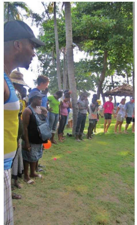
Below: A group prays in English and Creole at the mission compound this summer.