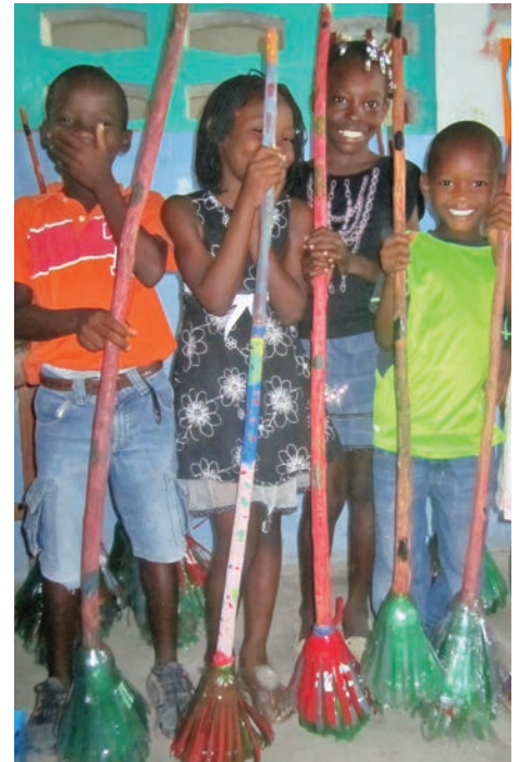
Above: Students make brooms from plastic bottles and sticks at LCM's summer camp.